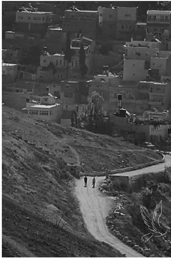
Mt. Zion, Israel

From Wednesday, February 17 th until Saturday, April 3 rd you are invited to follow Jesus up the mountain toward the cross. In ancient times, when worshippers went up to Jerusalem to worship the Lord at the time of Passover, they would sing and pray to aide in their journey. This Lenten season, resolve now that you will endeavor to make room for the Holy Spirit to do a new thing within you by meditating on scripture and praying daily. This guide is designed to offer you a path of ascent for the next 40 days. You will be equipped with a Bible passage and a prayer to pray along each step of the way. Mark off a time and a sacred space each day for yourself (and a group of family and/or friends, if possible) to discover God in the biblical text and in prayer.